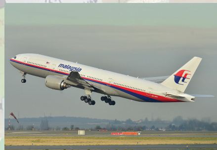
9M-MRO photographed in 2011

On board: 239 passengers Aircraft: Boeing 777 Flight Origin: Kuala Lumpur International Airport Destination: Beijing Capital International Airport Registration: 9M-MRO