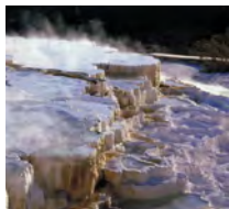
4. Mammoth Hot Springs