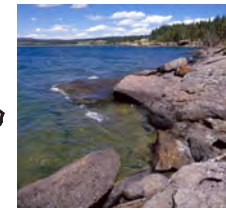
5. Yellowstone Lake