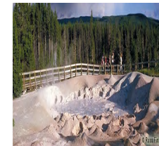
9. Lower Geyser Basin