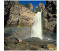
8. Tower Fall