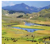
3. Hayden Valley