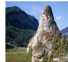
7. Lamar Valley