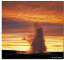
1. Old Faithful Geyser/Upper Basin