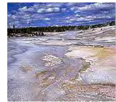
6. Norris Geyser Basin