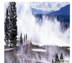
10. West Thumb Geyser Basin